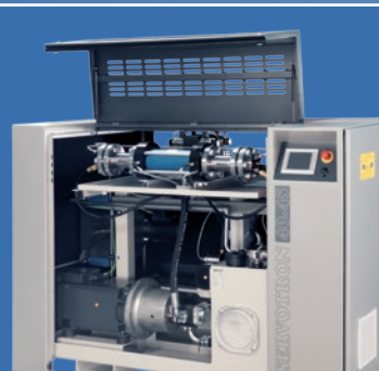
Excellent accessibility, easy to maintain and optimum operation.