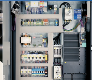
Control box with electric components and frequency controller.