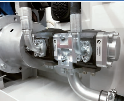
Highly dynamic, frequency-controlled hydraulic unit with servo drive and internal gear pump, dual version for higher flow rate.