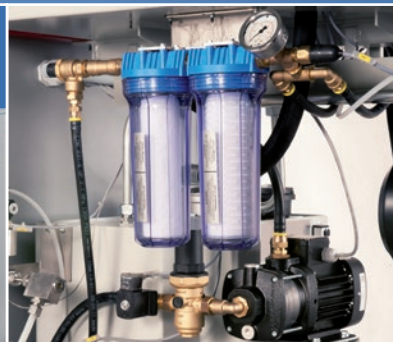
Feed water supply with booster pump and double filter unit.